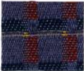
Hamlet Blue Clay