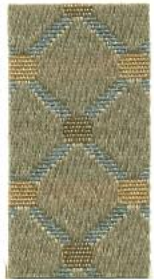
Chain Dot Coin