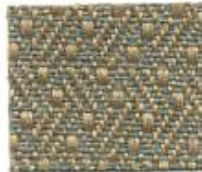
Zig Zag Putty Beige