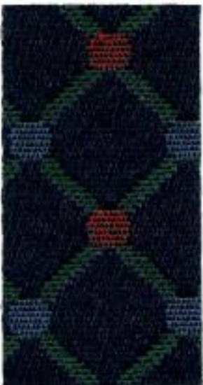
Chain Dot Navy