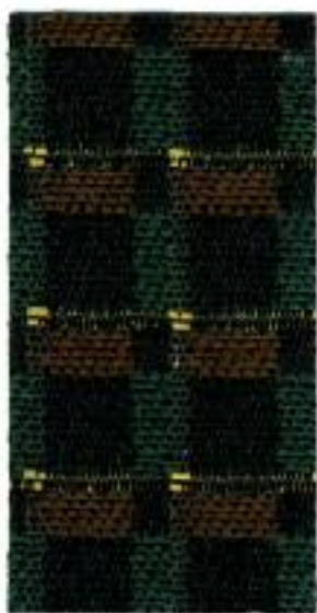
Hamlet Black Brown