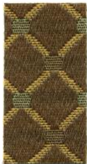
Chain Dot Rattan