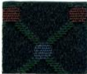
Chain Dot Emerald