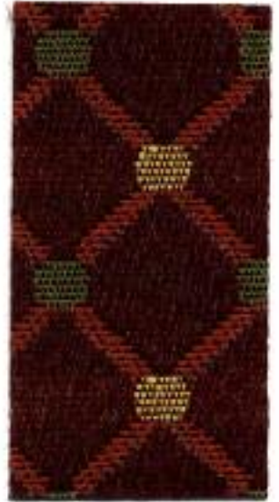
Chain Dot Wine