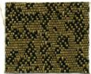
Maze Black Gold