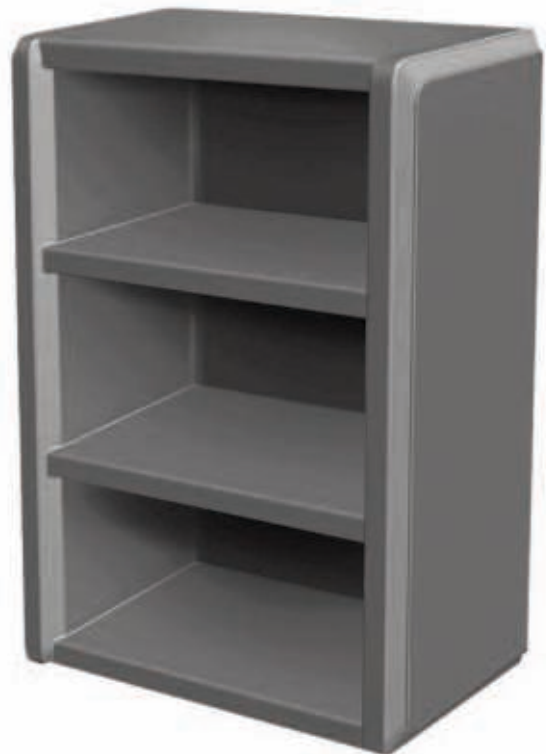
Molded Plastic Shelving for open storage of personal items. 30Wx18Dx42H